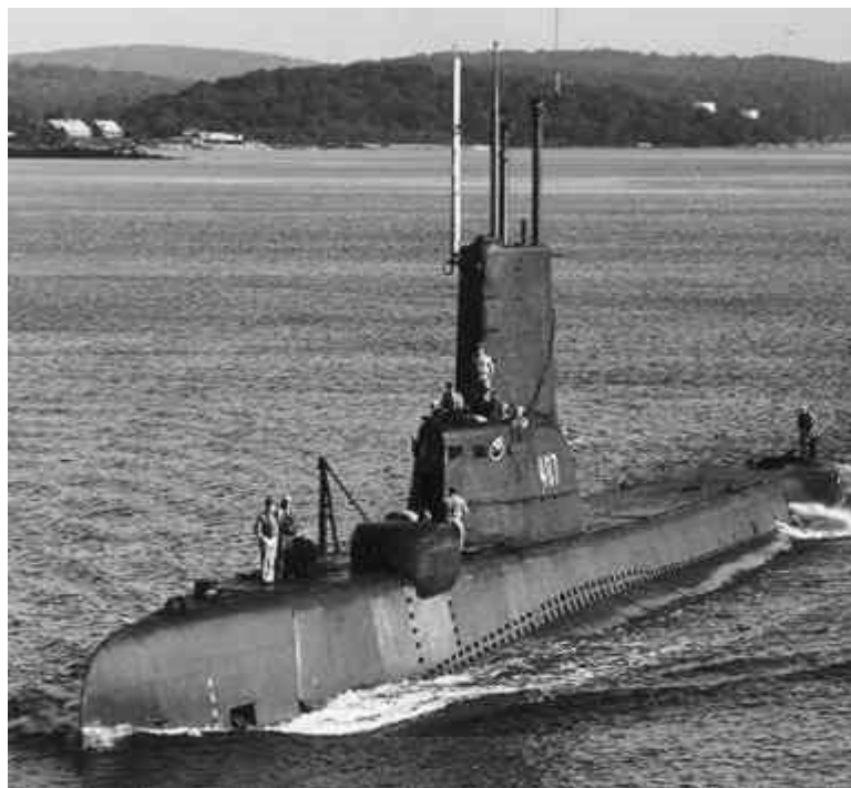
USS Sea Robin SS 407